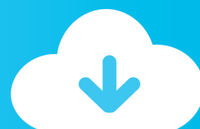
Tableau Desktop Professional Edition 2019.4.2 Cracked Working 100% Portable